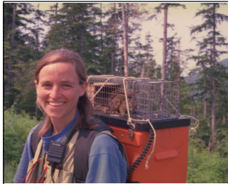
Translocation of individual squirrels across gaps for release and subsequent tracking.