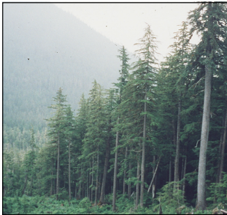
Forest-clearcut edge at central Mitkof Island study site, Tongass National Forest, Alaska. Logging is the primary land use.

To study factors for decisions by red squirrels ( Tamiasciurus hudsonicus ) to cross gaps in fragmented forests.